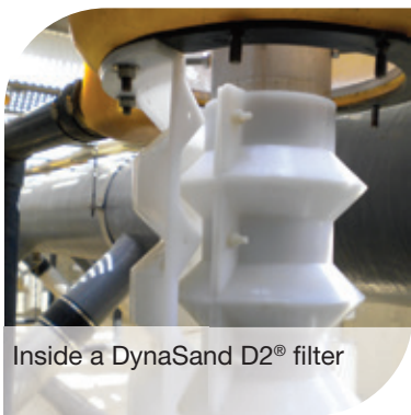
Inside a DynaSand D2® filter