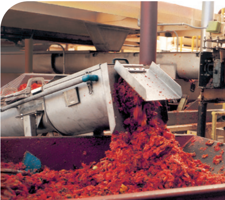
The Helixpress ® unit is ideal for industrial and municipal dewatering