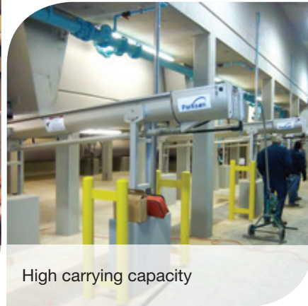
High carrying capacity